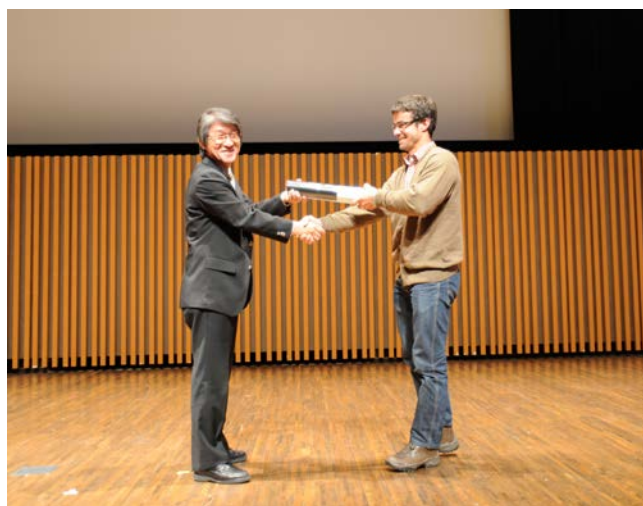
Passing a baton to 2 nd AOCNS in Closing Session