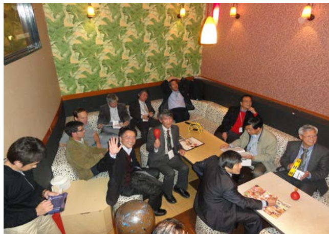
The Asia-Oceania Conference on KARAOKE

Chair of the Organizing Committee, 1 st AOCNS