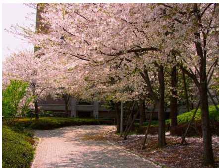
Figure 2. Figure caption for second of two sided figures (this is a jpg file).